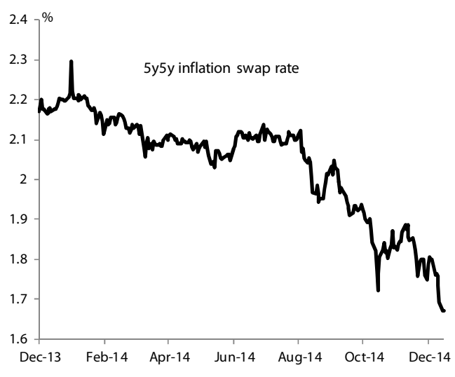
Figure 1 Long-term inflation expectations on a declining trend